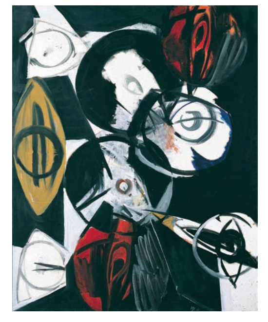
Die Nacht, 1963 Oil on canvas, 200 x 160 cm

Opening during Gallery Weekend: Friday, 29 April 6 - 9 pm