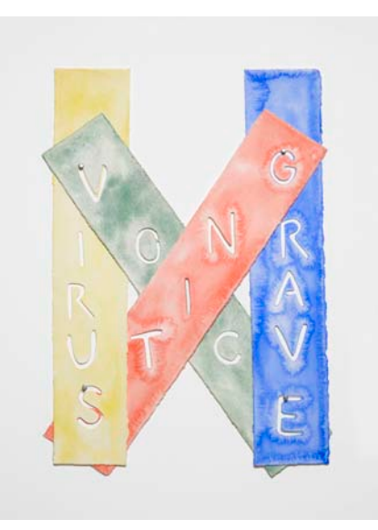
Nicole Wermers Untitled 2004 Paint & wood 2 parts, each 150 x 52 x 2.5 cm / 59 x 20.4 x 1 in

Christina Mackie Wordseaker Test 2005 Watercolour on paper 80 x 56 cm / 31.5 x 22 in