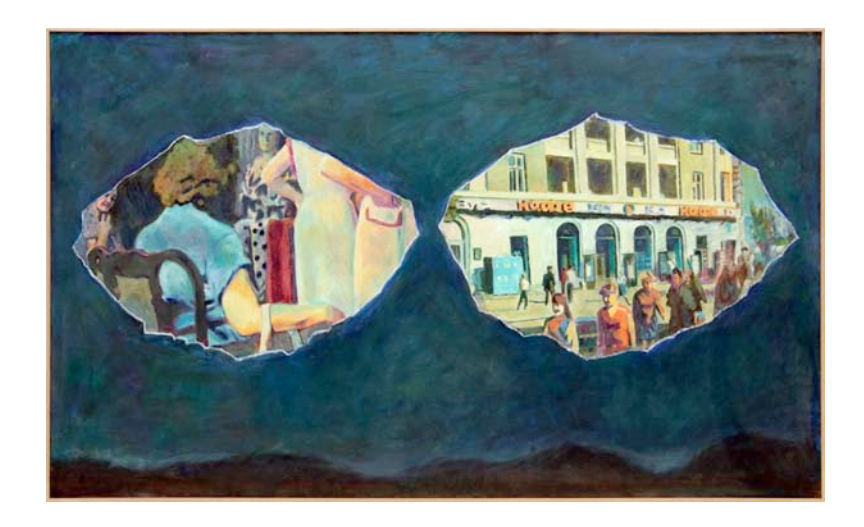
Ilya & Emilia Kabakov

Two Fragments On the Background of Cloudy Night, 2014 Oil on canvas 112 x 185.5 cm (44.09 x 73.03 in)