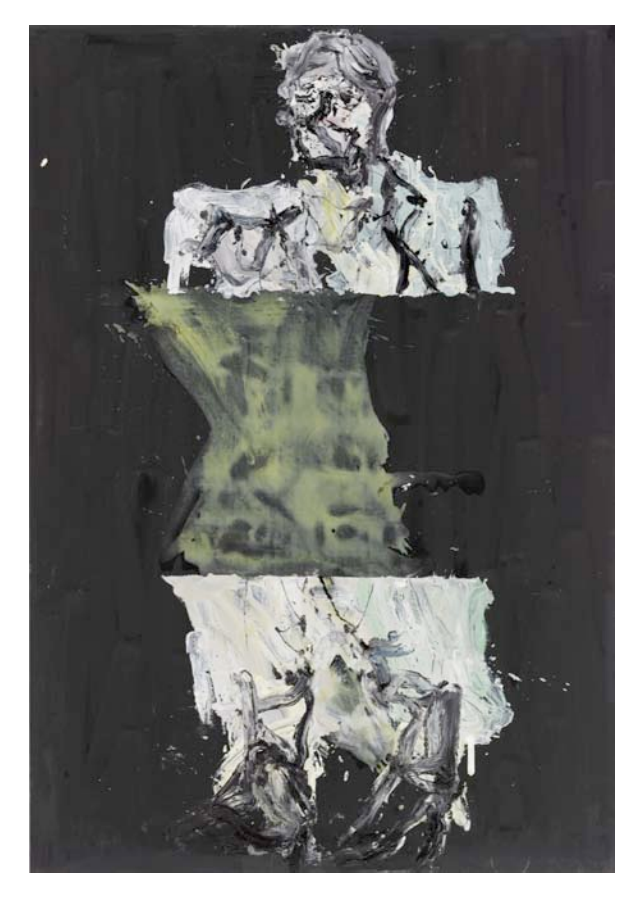
Georg Baselitz Bitte hinter den Kopf, 2014 Oil on canvas 300 x 207 cm (118.11 x 81.5 in)