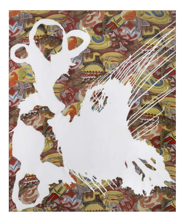
Sigmar Polke Untitled, 1984 Mixed Media on canvas 180 x 150 cm (70.87 x 59.06 in)

Two Fragments On the Background of Cloudy Night, 2014 Oil on canvas 112 x 185.5 cm (44.09 x 73.03 in)