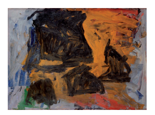
The Light, 1960, oil on Strathmore paperboard on masonite, 55,9 x 76,2 cm (22 x 30 in.)