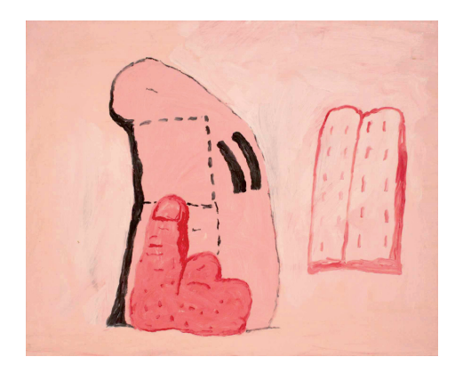
Untitled, 1971, oil on paper mounted on masonite, 72,5 x 89 cm (28 1/2 x 35 in.)